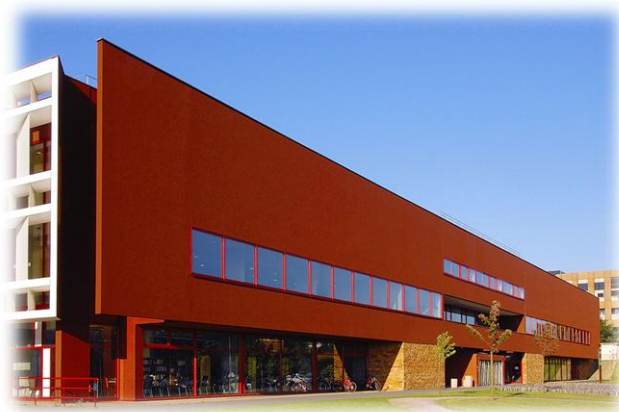
The University's library

When you arrive at Le Mans University – Université du Maine, at the study abroad office or via Facebook, do not hesitate to get in touch with: